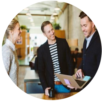
New! Management Consulting