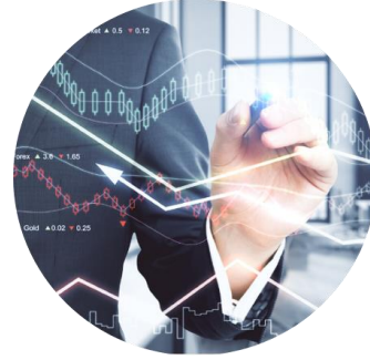
Big Data Fundamentals and Impacts