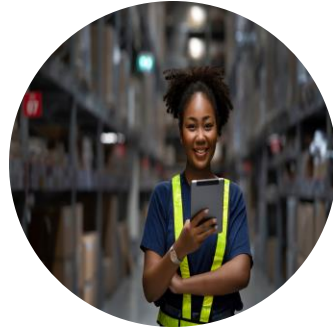
New! Green Supply Chain