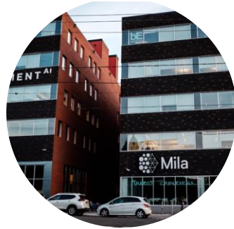
Telecom, IoT, & 5G