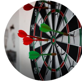
Soft-skills course Agile Industry Mindset (AIM)