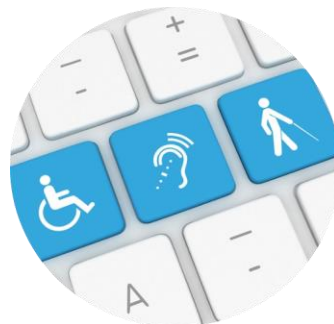
Accessibility in Technology