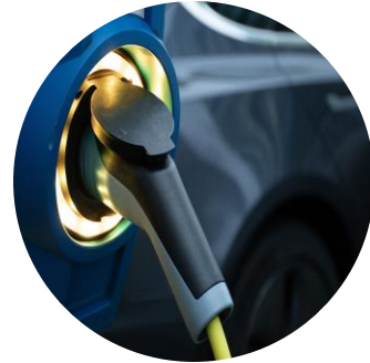
New! Green Transportation