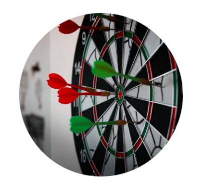
Newl Agile Industry Mindset (AIM)