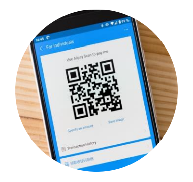
Intelligent Retail and Commerce